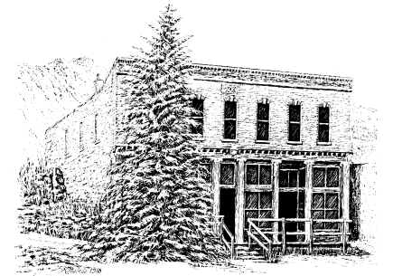
MASONIC BUILDING - NEVADAVILLE, COLORADO