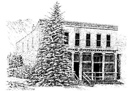
MASONIC BUILDING - NEVADAVILLE, COLORADO